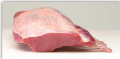
Durham Ranch Wild Boar French Rack

For centuries Europeans have known the benefits of this wild delicacy; not only for conservation and preservation efforts but for the value wild boar provides foodservice and retail customers. Throughout Central Europe, Wild Boar is considered one of the most premium meats available.