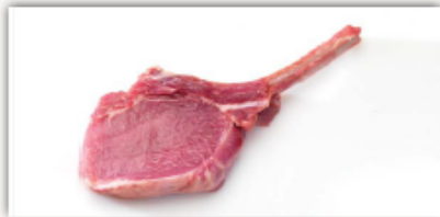
Durham Ranch Wild Boar Frenched Chop