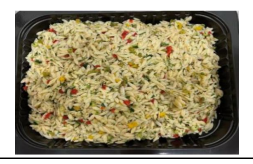
Crown's Latin Touch

Orzo Pasta tossed with peppers, onions and cucumbers in a bright and tangy lemon vinaigrette- a refreshing dish for your family