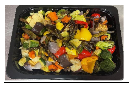
Crown 1 Upscale Deli Salads Lemon Orzo Salad

An assortment of 7 fresh vegetables tossed in a blend of house made seasoning and roasted to perfection. Pairs perfect with your favorite entrée